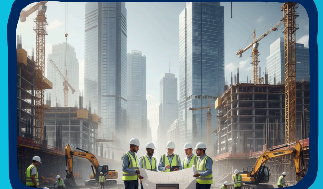
Real Estate & Infrastructure