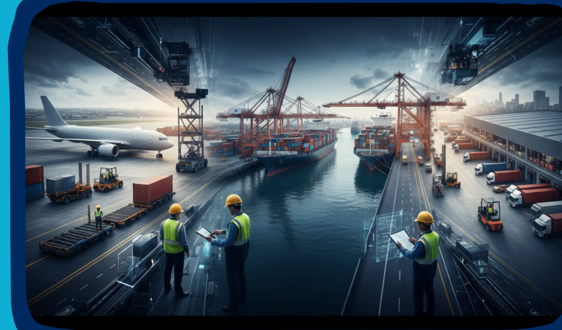
Logistics & Shipping