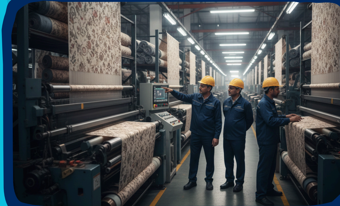
Manufacturing & Textiles