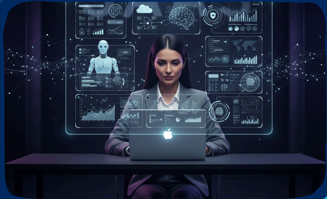
Information Technology (IT) & SaaS